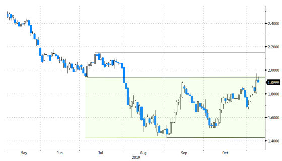
US 10-yr yield: rising towards upper bound of sideways trading range between 1.43% and 1.94%.