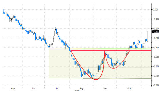
German 10-yr yield: painting double bottom on charts. Targets are -0.25% and -0.13%.

Technically, the German 10-yr yield and US 10-yr yield both rebounded away from August lows following ECB/Fed September policy meetings. The German 10-yr yield broke above -0.41% resistance, improving the technical picture. Targets of this double bottom formation are -0.25% and -0.13%. The 38% retracement level of the Oct-Aug decline stands at -0.24%. The US 10-yr yield trades in the 1.43%-1.94% sideways trading channel. The upper bound is within reach